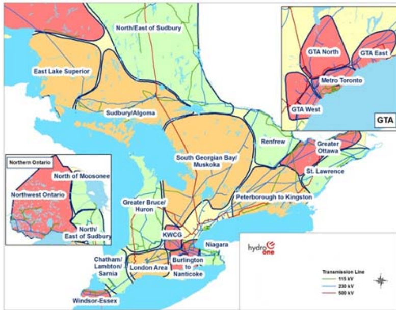
Figure 2. Regional Planning Regions