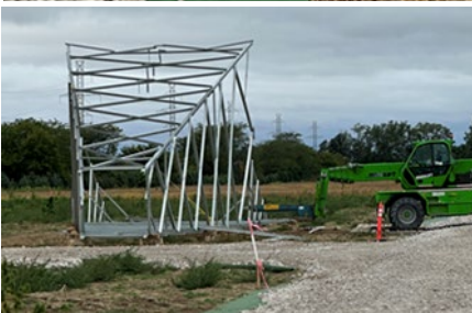
Photo of an access road and tower being assembled in Chatham

Since our last update , we announced that the new line will be completed by the end of 2024 – a full year ahead of schedule . We are proud to be able to advance this project by working closely with communities, along with advancing procurement activities.