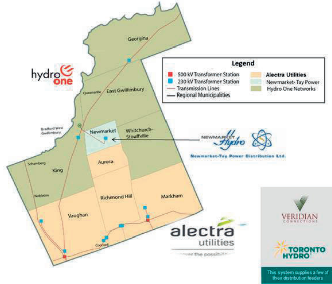
Figure B-2: Geographical Boundaries of GTA North (York Region)

The GTA North Region (York Region), as shown in Figure B-1, roughly comprises of municipalities in York Region (Vaughan, Richmond Hill, Markham, Aurora, Newmarket, King, East Gwillimbury, Whitchurch-Stouffville and Georgina) and Chippewas of Georgina Island. Its electrical infrastructure also serves parts of the City of Toronto, Brampton, and Mississauga.