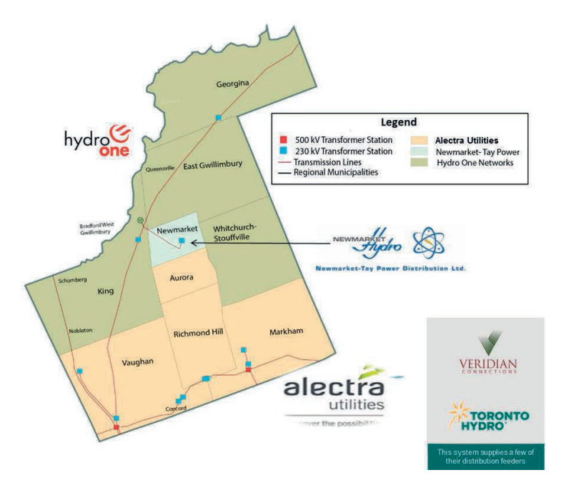
Figure 1: Geographical Boundaries of GTA North (York Region)

GTA North Region (York Region) is one of the fastest growing regions in Ontario. Provincial policies, including the Places to Grow Act and the Greenbelt Act, have played a key role in facilitating and driving development in this region. While a large portion of the land in this region is part of the designated Greenbelt area and is protected from urban development, the 2005 Places to Grow Act has promoted rapid intensification and development in specific designated urban areas surrounding and south of the Greenbelt. Extensive urbanization in these areas over the past decade has resulted in continued increase in electricity demand. In 2017, GTA North (York Region) had an electricity demand peak of over 2000 MW. Under the updated province's Places to Grow Act 2017, significant population growth and intensification are expected to continue in GTA North (York Region) in the coming decades.