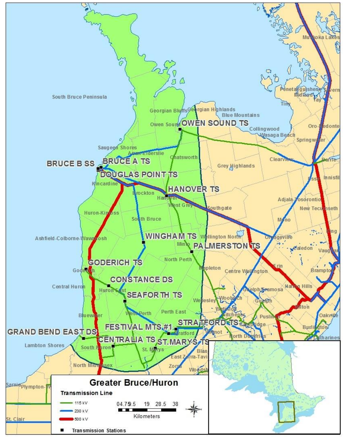
Figure 1: Geographic Area of the Greater Bruce-Huron Region

The Greater Bruce-Huron Region covers the counties of Bruce, Huron and Perth, as well as portions of Grey, Wellington, Waterloo, Oxford and Middlesex counties. The boundary of the Greater Bruce-Huron Region is shown in Figure 1.