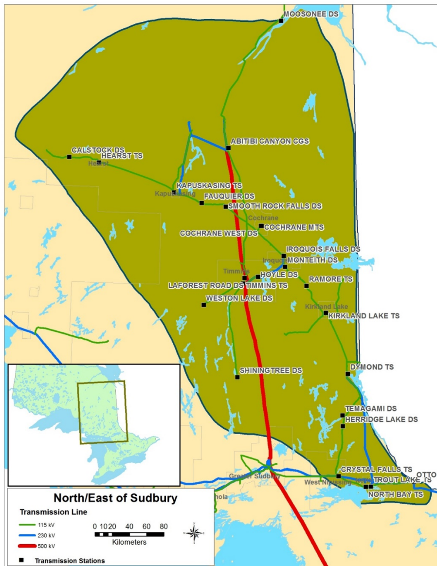
Figure 1: North & East of Sudbury Region Map

The North & East of Sudbury Region are bounded by regions of North Bay, Timmins, Hearst, Moosonee, Kirkland Lake and Dymond. A map of the region is shown below in Figure 1.